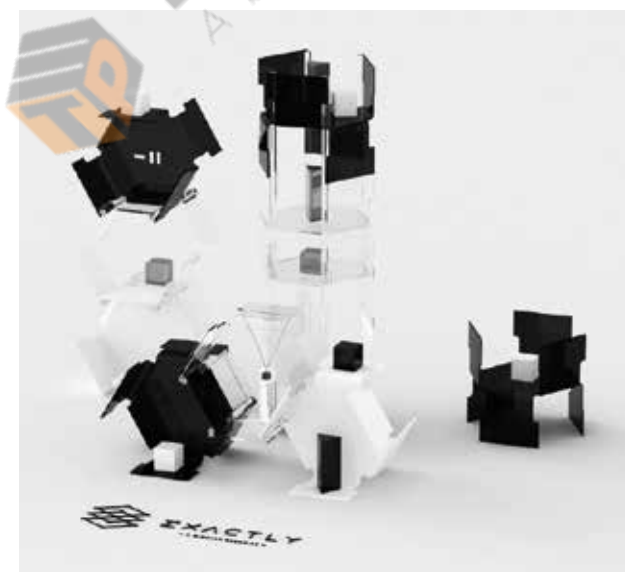
Project: Studio Creativo Menopausa – II